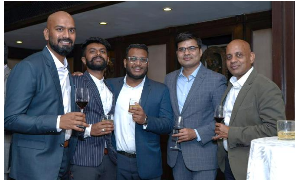
(Left) Six wines were profiled during the sit-down tasting, (Right) participants enjoying the event.